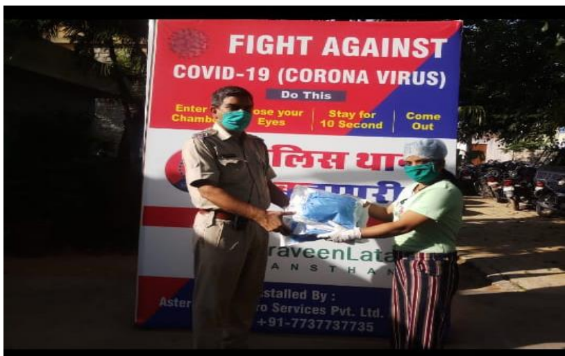
PPE Kit being handed over to a Police officer

Note: The PPE kit is reusable up to 30 washes.