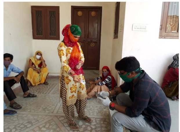
Distribution of Dry Ration Kits