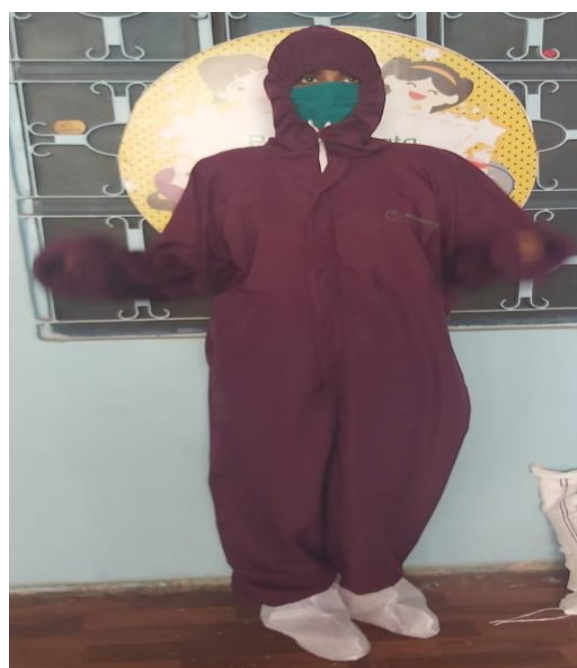
PLS Field Staff in a PPE