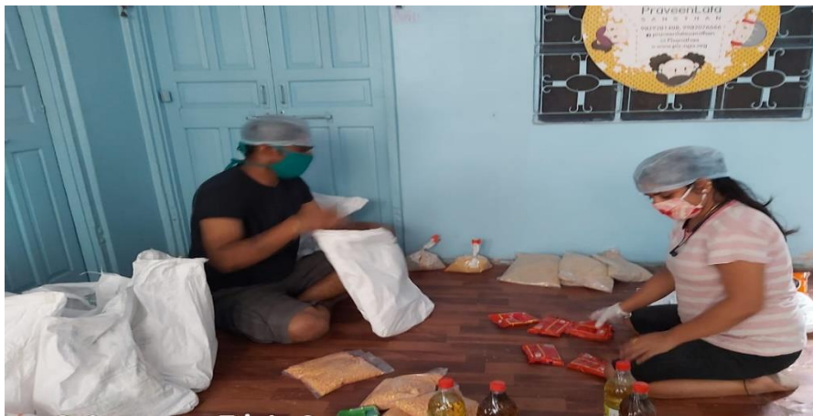
Preparation of Dry ration kits by the PLS Team